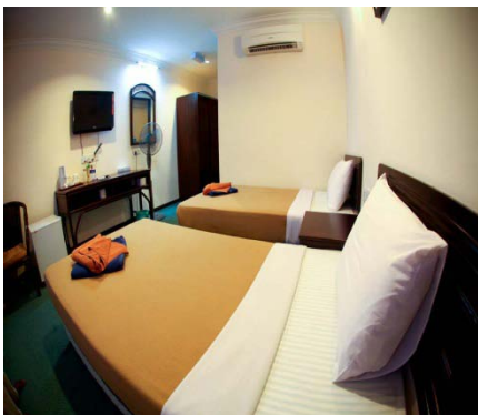
Standard Super Single